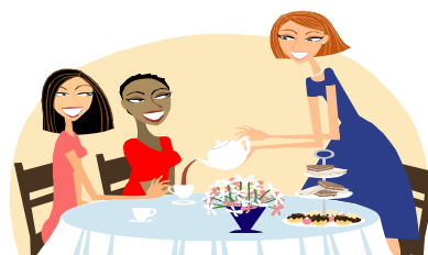
MEET ME AT WELLSLEE'S ALL STRUNG OUT